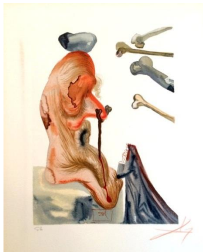
Figure 4. Canto Eighteen: The Fraudulent in the Eighth Circle