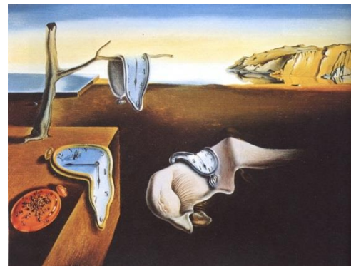
Figure 2. Dali's Persistence of Memory