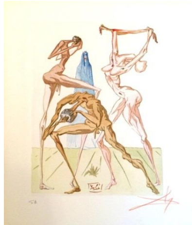
Figure 3. Canto Sixteen: The Sodomies in the Seventh Circle

who have very narrow and elongated waists and legs. By drawing these gay men, Dali wanted to show their physical and mental defects. In Dali's paintings, showing waist too thin, prolonged and facing feet intertwined with each other represent an emphatic anatomical deficiency (Dine 59).