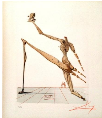
Figure 5. Canto Twenty Eight: Bertran de Born in the Eighth Circle