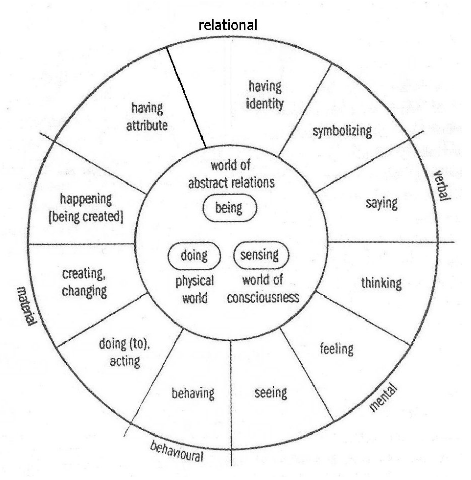
Figure 2. The grammar of experience: types of process in English